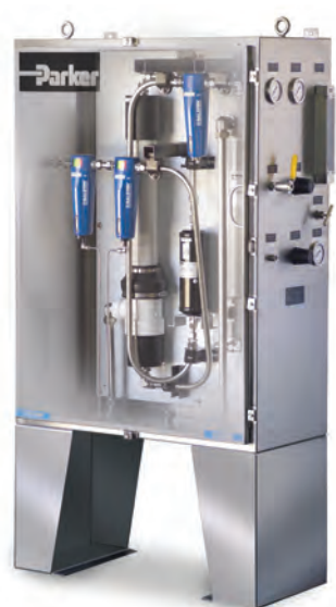
Model with Membrane Dryer for Gas Seals

A typical application is pressurizing dry gas seals on selected GAScompressor and turbine installations that need inert gas forlubricating and pressurizing dry seals designed to contain flamable, toxic, or hazardous process gasses from leaking into the atmosphere.