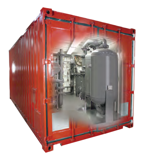
High flow 3000 scfm (5100 m³hr), 95% N2 system installed in a standard 20 ft (6.1 m) ISO shipping container for operation in arctic conditions, ZONE II compliant.